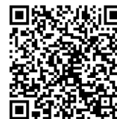
FILE A CHARGE LINK

You can send the EEOC a signed letter describing your employment discrimination concerns. This signed letter becomes what the EEOC calls a "charge of discrimination" that states an employer, union, or employment agency unlawfully discriminated against you. EEOC.gov has a list of information that you need to include in the letter. The EEOC will review your letter and let you know if more information is needed.